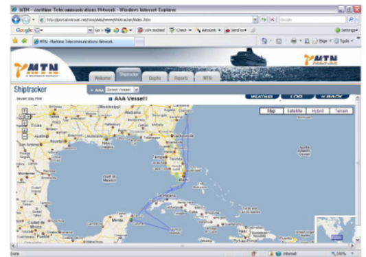
SeaMobile ShipTracker Utility

(1) 4006-33 is the minimum specification in South Pacific and/or IOR. (2) Plans of 128 kbit/s CIR and above support Skype. Slingbox supported on plans above 512 kbit/s CIR. (3) Television is available in certain regions and with limited content. (4) Monthly fixed costs are higher in South Pacific and the Northern Indian Ocean. CIR: Committed Information Rate MIR: Maximum Information Rate. MSP: Maritime Service Provider. QoS: Quality of Service